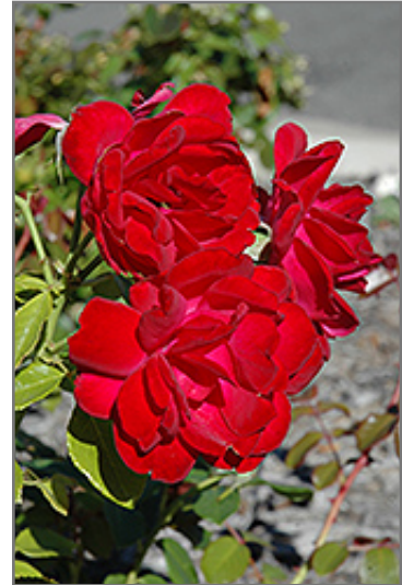
My Girl Rose flowers