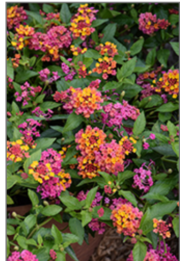
PassionFruit Lantana flowers