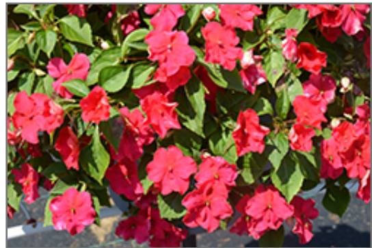
Beacon Lipstick Impatiens flowers