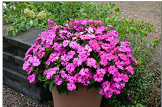
Solarscape XL Pink Jewel Impatiens in bloom