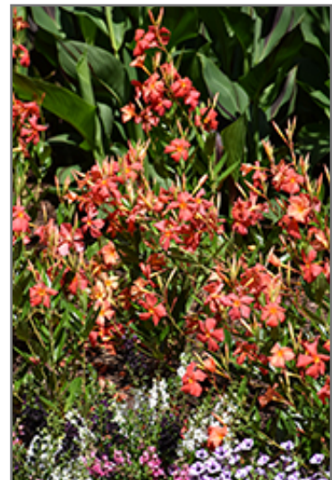
Sun Parasol Fired Up Orange Mandevilla in bloom