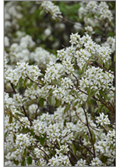
Saskatoon flowers

Saskatoon is a multi-stemmed deciduous shrub with an upright spreading habit of growth. Its relatively fine texture sets it apart from other landscape plants with less refined foliage.