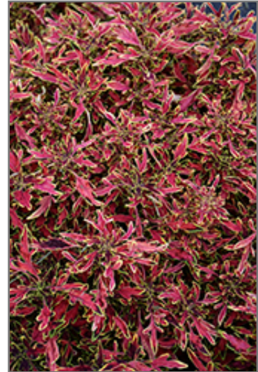
ColorBlaze Mini Me Watermelon Coleus foliage

ColorBlaze Mini Me Watermelon Coleus is a fine choice for the garden, but it is also a good selection for planting in outdoor containers and hanging baskets. It is often used as a 'filler' in the 'spiller-thriller-filler' container combination, providing a canvas of foliage against which the larger thriller plants stand out. Note that when growing plants in outdoor containers and baskets, they may require more frequent waterings than they would in the yard or garden.