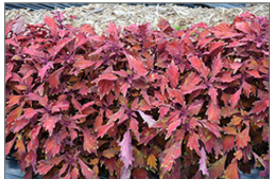
FlameThrower Habanero Coleus