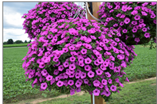
Supertunia Vista Jazzberry Petunia in bloom