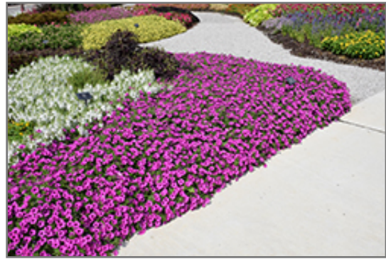
Supertunia Vista Jazzberry Petunia in bloom

Supertunia Vista Jazzberry Petunia is a fine choice for the garden, but it is also a good selection for planting in outdoor containers and hanging baskets. Because of its trailing habit of growth, it is ideally suited for use as a 'spiller' in the 'spiller-thriller-filler' container combination; plant it near the edges where it can spill gracefully over the pot. It is even sizeable enough that it can be grown alone in a suitable container. Note that when growing plants in outdoor containers and baskets, they may require more frequent waterings than they would in the yard or garden.