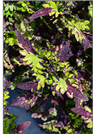
Rodeo Drive Coleus foliage

Rodeo Drive Coleus is recommended for the following landscape applications;