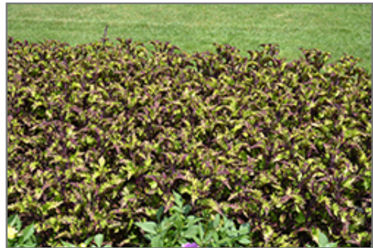
Rodeo Drive Coleus