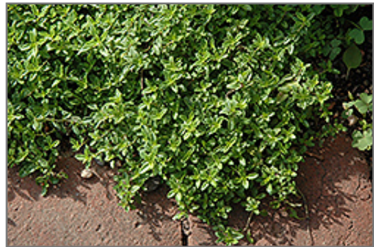
Lime Thyme foliage