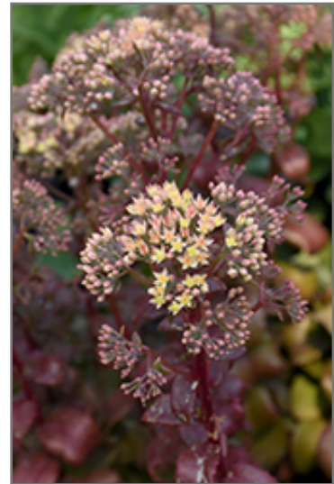
Peach Pearls Stonecrop flowers

Peach Pearls Stonecrop is recommended for the following landscape applications;