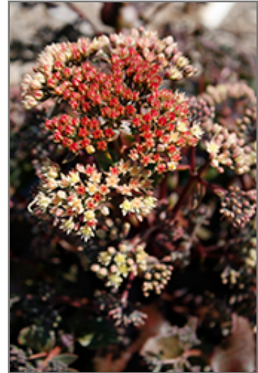
Peach Pearls Stonecrop flowers

Peach Pearls Stonecrop is a fine choice for the garden, but it is also a good selection for planting in outdoor pots and containers. With its upright habit of growth, it is best suited for use as a 'thriller' in the 'spiller-thriller-filler' container combination; plant it near the center of the pot, surrounded by smaller plants and those that spill over the edges. Note that when growing plants in outdoor containers and baskets, they may require more frequent waterings than they would in the yard or garden. Be aware that in our climate, most plants cannot be expected to survive the winter if left in containers outdoors, and this plant is no exception. Contact our experts for more information on how to protect it over the winter months.