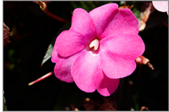
SunPatiens Compact Hot Pink New Guinea Impatiens flowers

SunPatiens Compact Hot Pink New Guinea Impatiens is recommended for the following landscape applications;