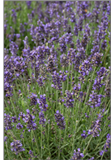
Blue Spear Lavender flowers

Blue Spear Lavender is recommended for the following landscape applications;