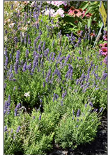
Blue Spear Lavender in bloom

Blue Spear Lavender is a fine choice for the garden, but it is also a good selection for planting in outdoor pots and containers. It is often used as a 'filler' in the 'spiller-thriller-filler' container combination, providing a mass of flowers and foliage against which the thriller plants stand out. Note that when growing plants in outdoor containers and baskets, they may require more frequent waterings than they would in the yard or garden.