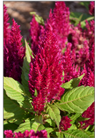
First Flame Purple Celosia flowers

First Flame Purple Celosia is recommended for the following landscape applications;