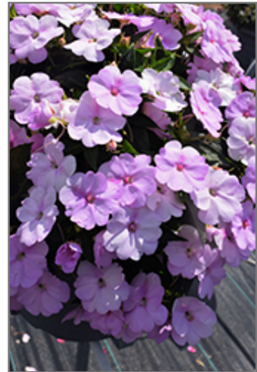
SunPatiens Compact Orchid Blush Impatiens flowers

SunPatiens Compact Orchid Blush Impatiens is recommended for the following landscape applications;