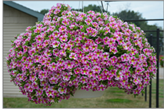
Superbells Holy Cow! Calibrachoa in bloom