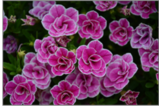
Superbells Doublette Love Swept Calibrachoa flowers