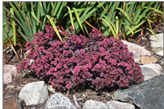
Dream Dazzler Stonecrop in bloom