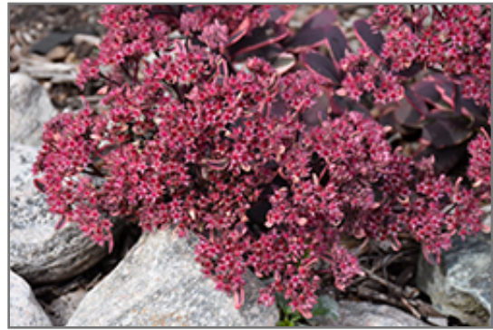
Dream Dazzler Stonecrop flowers