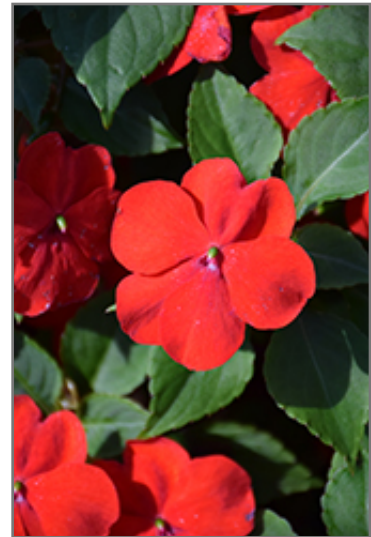
Beacon Bright Red Impatiens flowers