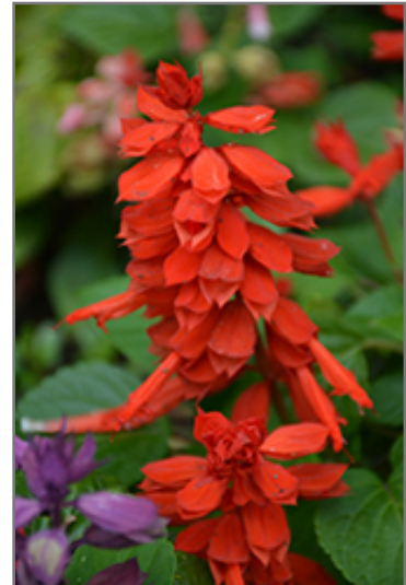
Vista Red Sage flowers