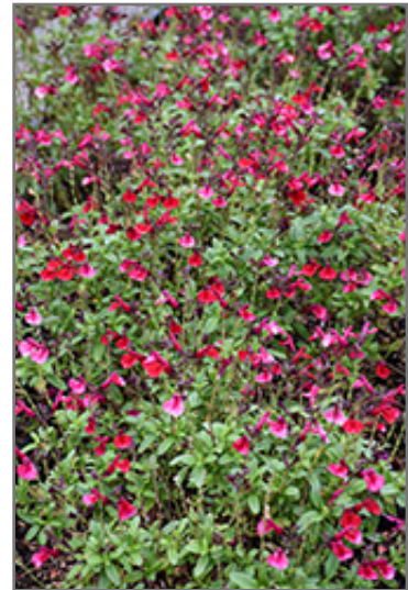
Mirage Cherry Red Autumn Sage flowers

This is a relatively low maintenance plant, and should only be pruned after flowering to avoid removing any of the current season's flowers. It is a good choice for attracting bees, butterflies and hummingbirds to your yard, but is not particularly attractive to deer who tend to leave it alone in favor of tastier treats. It has no significant negative characteristics.