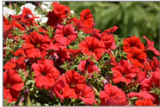
Supertunia Really Red Petunia flowers

Supertunia Really Red Petunia will grow to be about 8 inches tall at maturity, with a spread of 12 inches. When grown in masses or used as a bedding plant, individual plants should be spaced approximately 8 inches apart. Its foliage tends to remain low and dense right to the ground. This fast-growing annual will normally live for one full growing season, needing replacement the following year.