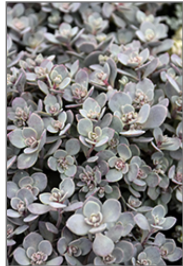
SunSparkler Blue Elf Sedoro foliage

SunSparkler Blue Elf Sedoro is a fine choice for the garden, but it is also a good selection for planting in outdoor pots and containers. Because of its spreading habit of growth, it is ideally suited for use as a 'spiller' in the 'spiller-thriller-filler' container combination; plant it near the edges where it can spill gracefully over the pot. Note that when growing plants in outdoor containers and baskets, they may require more frequent waterings than they would in the yard or garden. Be aware that in our climate, most plants cannot be expected to survive the winter if left in containers outdoors, and this plant is no exception. Contact our experts for more information on how to protect it over the winter months.