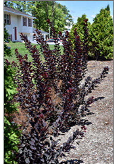
Winecraft Black Smokebush

This shrub should only be grown in full sunlight. It is very adaptable to both dry and moist locations, and should do just fine under average home landscape conditions. It is not particular as to soil type or pH. It is highly tolerant of urban pollution and will even thrive in inner city environments, and will benefit from being planted in a relatively sheltered location. This is a selected variety of a species not originally from North America.