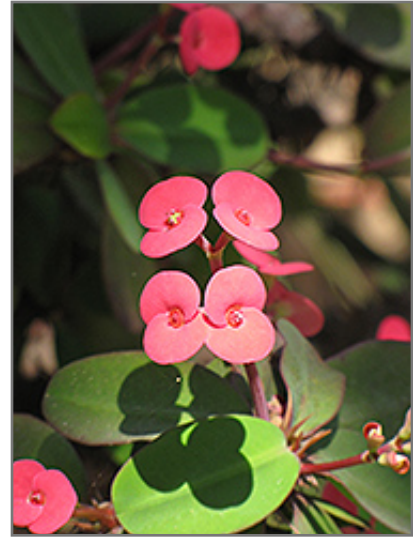
Crown Of Thorns flowers

This is a multi-stemmed evergreen houseplant with an upright spreading habit of growth. This plant may benefit from an occasional pruning to look its best.