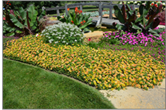
Supertunia Honey Petunia in bloom

Supertunia Honey Petunia will grow to be about 10 inches tall at maturity, with a spread of 24 inches. When grown in masses or used as a bedding plant, individual plants should be spaced approximately 20 inches apart. Its foliage tends to remain low and dense right to the ground. This fast-growing annual will normally live for one full growing season, needing replacement the following year.