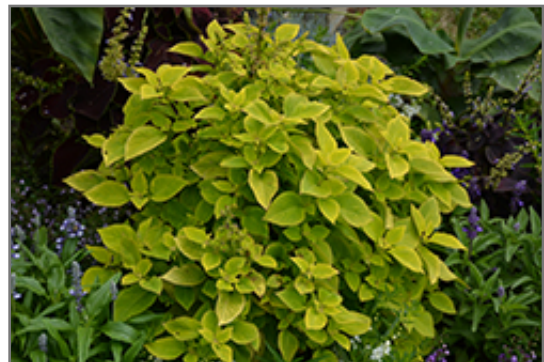
Premium Sun Lime Delight Coleus