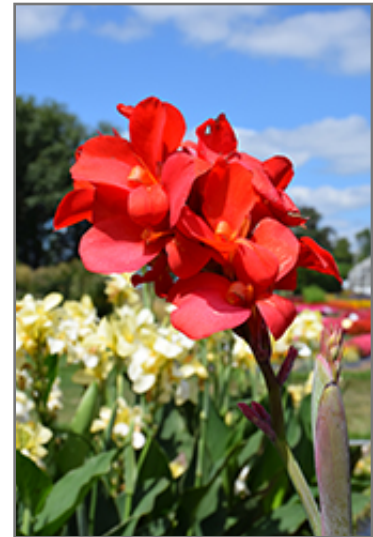
Cannova Bronze Scarlet Canna flowers

Cannova Bronze Scarlet Canna is a fine choice for the garden, but it is also a good selection for planting in outdoor pots and containers. With its upright habit of growth, it is best suited for use as a 'thriller' in the 'spiller-thriller-filler' container combination; plant it near the center of the pot, surrounded by smaller plants and those that spill over the edges. It is even sizeable enough that it can be grown alone in a suitable container. Note that when growing plants in outdoor containers and baskets, they may require more frequent waterings than they would in the yard or garden. Be aware that in our climate, most plants cannot be expected to survive the winter if left in containers outdoors, and this plant is no exception. Contact our experts for more information on how to protect it over the winter months.