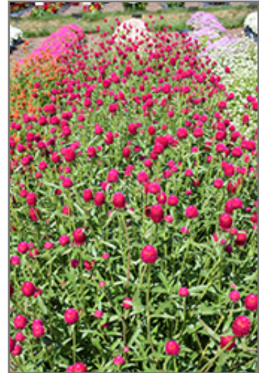
Qis Carmine Gomphrena in bloom

Qis Carmine Gomphrena is a fine choice for the garden, but it is also a good selection for planting in outdoor pots and containers. With its upright habit of growth, it is best suited for use as a 'thriller' in the 'spiller-thriller-filler' container combination; plant it near the center of the pot, surrounded by smaller plants and those that spill over the edges. Note that when growing plants in outdoor containers and baskets, they may require more frequent waterings than they would in the yard or garden.