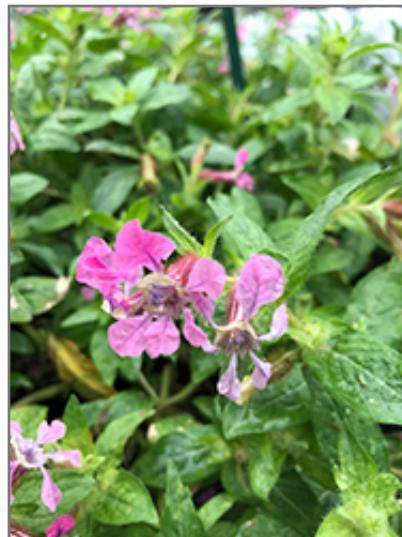
Sriracha Pink Cuphea flowers