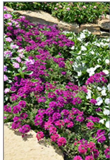
Superbena Royale Plum Wine Verbena in bloom