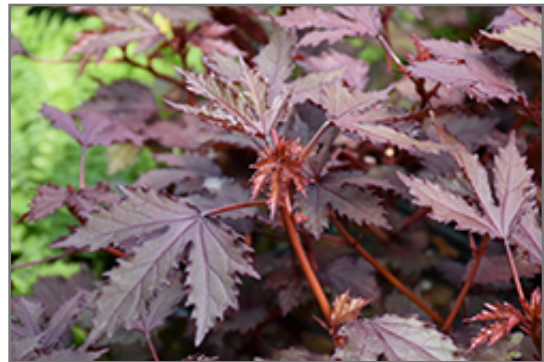
Mahogany Splendor Hibiscus foliage