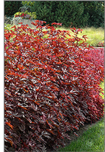
Mahogany Splendor Hibiscus

Mahogany Splendor Hibiscus is ideally suited for growing in a pond, water garden or patio water container, and is recommended for the following landscape applications;