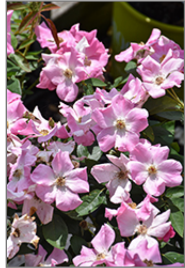
Nearly Wild Rose flowers