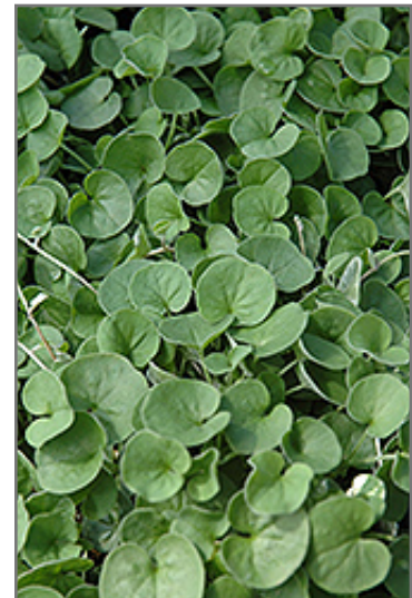
Emerald Falls Dichondra foliage