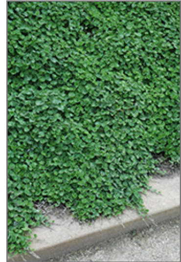
Emerald Falls Dichondra