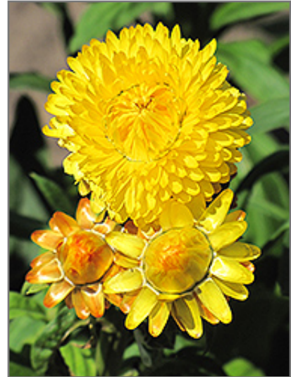
Dreamtime Jumbo Yellow Strawflower flowers