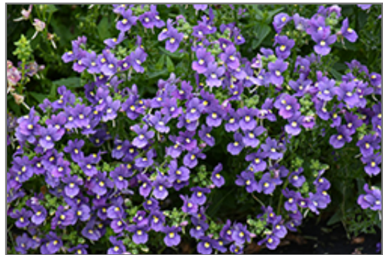
Bluebird Nemesia flowers