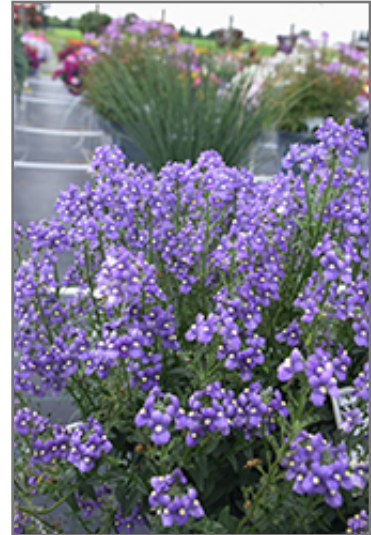
Bluebird Nemesia flowers