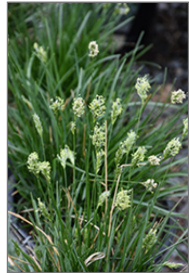
Blue Moor Grass flowers