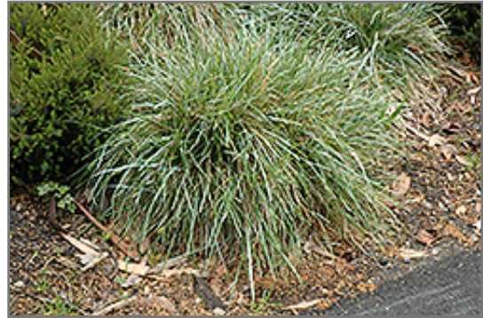
Blue Moor Grass