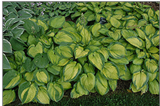
Paradigm Hosta