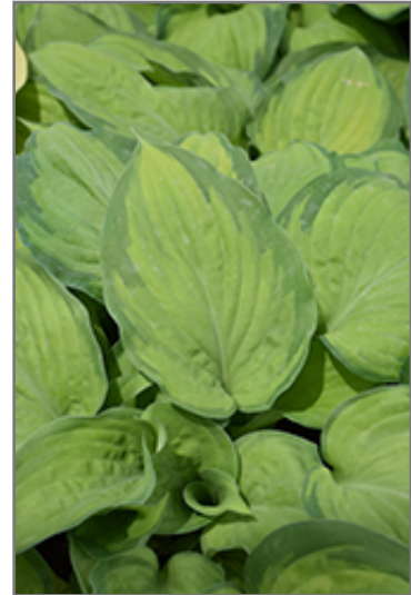
Paradigm Hosta foliage

This plant does best in partial shade to shade. It prefers to grow in average to moist conditions, and shouldn't be allowed to dry out. It is not particular as to soil type or pH. It is somewhat tolerant of urban pollution. This particular variety is an interspecific hybrid. It can be propagated by division; however, as a cultivated variety, be aware that it may be subject to certain restrictions or prohibitions on propagation.