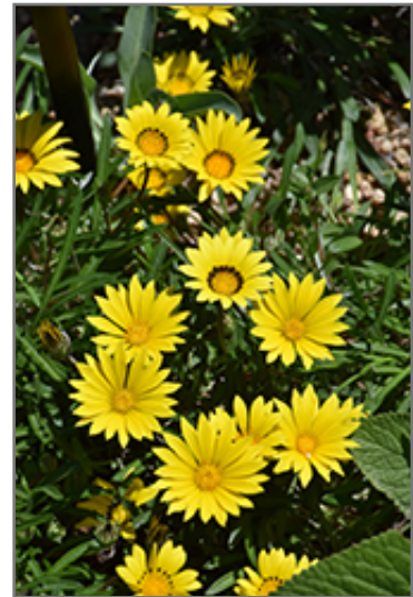
Colorado Gold Gazania flowers

Colorado Gold Gazania is recommended for the following landscape applications;