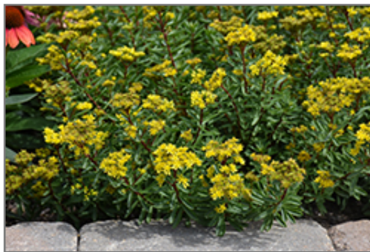
Yellow Diamonds Stonecrop flowers