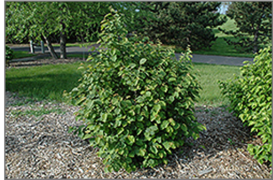
Beaked Hazelnut

Beaked Hazelnut will grow to be about 8 feet tall at maturity, with a spread of 7 feet. It tends to be a little leggy, with a typical clearance of 2 feet from the ground, and is suitable for planting under power lines. It grows at a medium rate, and under ideal conditions can be expected to live for approximately 30 years. While it is considered to be somewhat self-pollinating, it tends to set heavier quantities of fruit with a different variety of the same species growing nearby.