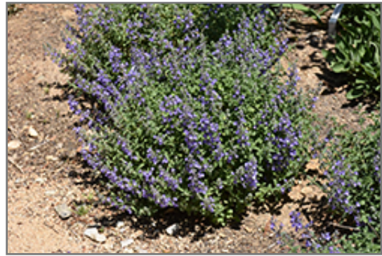
Sylvester Blue Catmint in bloom

Sylvester Blue Catmint is recommended for the following landscape applications;