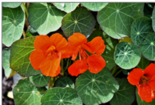
Empress of India Nasturtium flowers