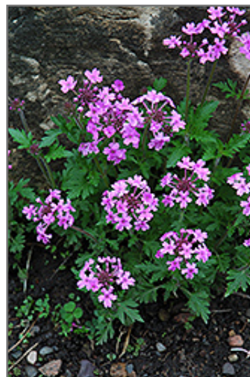
Drumstick Primrose in bloom

This plant does best in partial shade to shade. It does best in average to evenly moist conditions, but will not tolerate standing water. It is not particular as to soil type or pH. It is somewhat tolerant of urban pollution, and will benefit from being planted in a relatively sheltered location. Consider covering it with a thick layer of mulch in winter to protect it in exposed locations or colder microclimates. This species is not originally from North America.