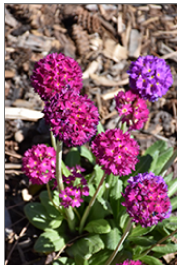
Drumstick Primrose flowers