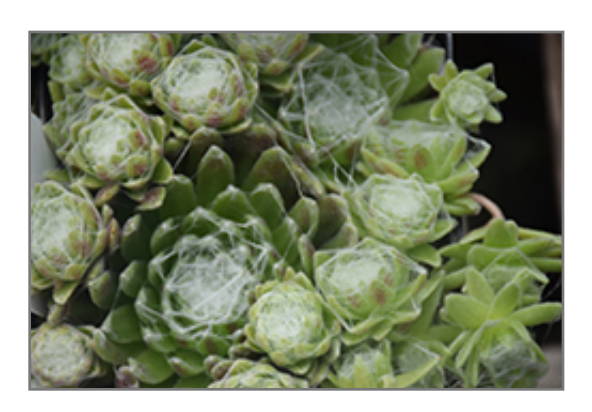
Cobweb Buttons Hens And Chicks

This plant will require occasional maintenance and upkeep, and should not require much pruning, except when necessary, such as to remove dieback. Deer don't particularly care for this plant and will usually leave it alone in favor of tastier treats. Gardeners should be aware of the following characteristic(s) that may warrant special consideration;