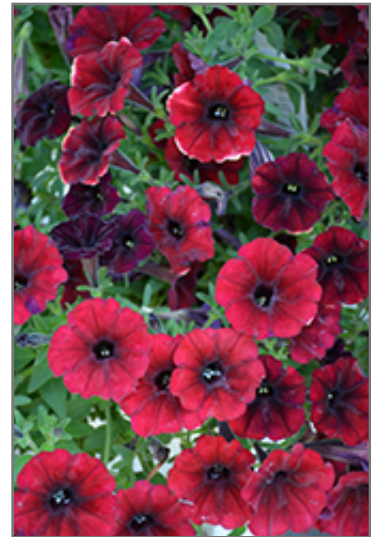
Supertunia Black Cherry Petunia flowers

Supertunia Black Cherry Petunia is a dense herbaceous annual with a trailing habit of growth, eventually spilling over the edges of hanging baskets and containers. Its medium texture blends into the garden, but can always be balanced by a couple of finer or coarser plants for an effective composition.