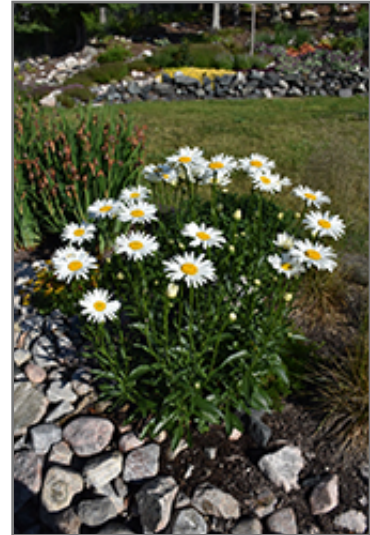
Becky Shasta Daisy in bloom

Becky Shasta Daisy is a fine choice for the garden, but it is also a good selection for planting in outdoor pots and containers. Because of its height, it is often used as a 'thriller' in the 'spiller-thriller-filler' container combination; plant it near the center of the pot, surrounded by smaller plants and those that spill over the edges. It is even sizeable enough that it can be grown alone in a suitable container. Note that when growing plants in outdoor containers and baskets, they may require more frequent waterings than they would in the yard or garden. Be aware that in our climate, most plants cannot be expected to survive the winter if left in containers outdoors, and this plant is no exception. Contact our experts for more information on how to protect it over the winter months.