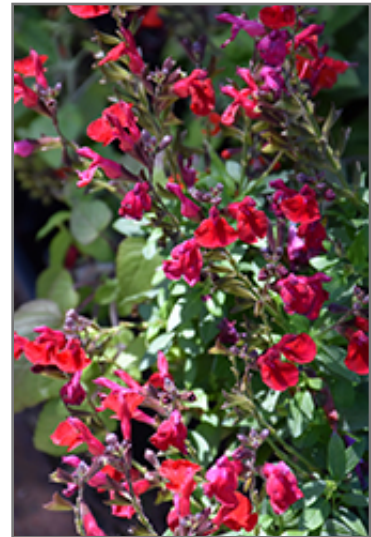
Mirage Cherry Red Autumn Sage flowers