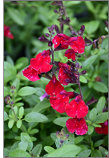
Mirage Cherry Red Autumn Sage flowers

This is a relatively low maintenance plant, and should only be pruned after flowering to avoid removing any of the current season's flowers. It is a good choice for attracting bees, butterflies and hummingbirds to your yard, but is not particularly attractive to deer who tend to leave it alone in favor of tastier treats. It has no significant negative characteristics.