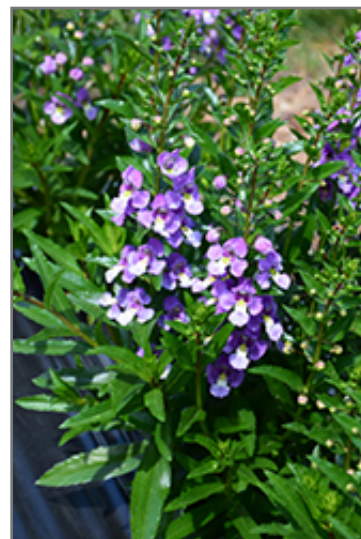
Archangel Blue Bicolor Angelonia flowers

Archangel Blue Bicolor Angelonia is recommended for the following landscape applications;